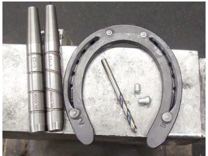
FootPro Solid Carbide Studs, Step Point Bit and Bloom Stud Set tools

One option for a high-performance bit is the US made KnKut Step Point bit, now available from your FPD dealer. This bit has a unique point that “bites” instantly when making contact with the shoe. So much so that in many cases you don't need to center punch to get started, unless you are punching just to make sure of your position on the shoe. The Step Point actually works as if you have drilled a pilot hole, lessening the stress on the full bit dimension and creating less heat. Heat is a contributing factor to the wear of a bit and reducing it will increase bit life.