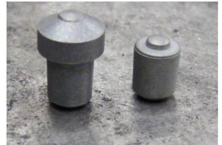
FootPro Studs – C11 on left and C13 on right