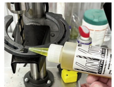
Cutting Fluid applied before drilling

Once you've drilled the stud hole, carefully position your stud before striking to be sure it is going in straight. Make one light blow to get it started correctly and then drive to the desired depth. It's important not to “bottom out” a stud on the anvil, something that usually would not occur except when using thinner shoes that are 1/4" or 7mm.