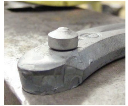
C11 applied – note the small gap between head and shoe surface.

Drive-in studs are an efficient way to provide traction for icy conditions, or travel across hard surfaces. In many cases, the solid carbide studs can be used for more than one shoeing cycle. Carefully applied, they are one more good tool to have in your rig.